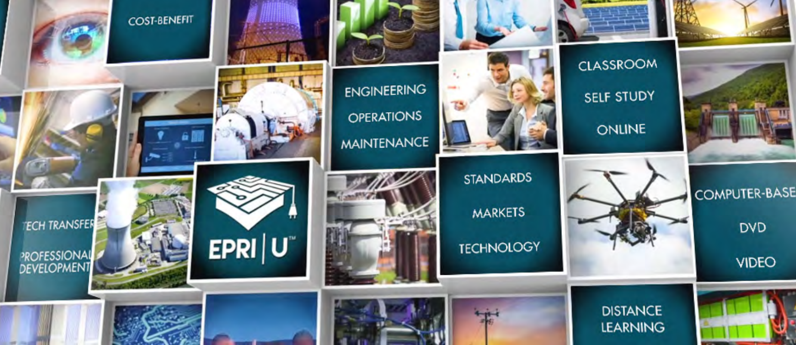
COG and EPRI exchange knowledge, research and lessons learned for the benefit of each organization's members and the wider nuclear industry.